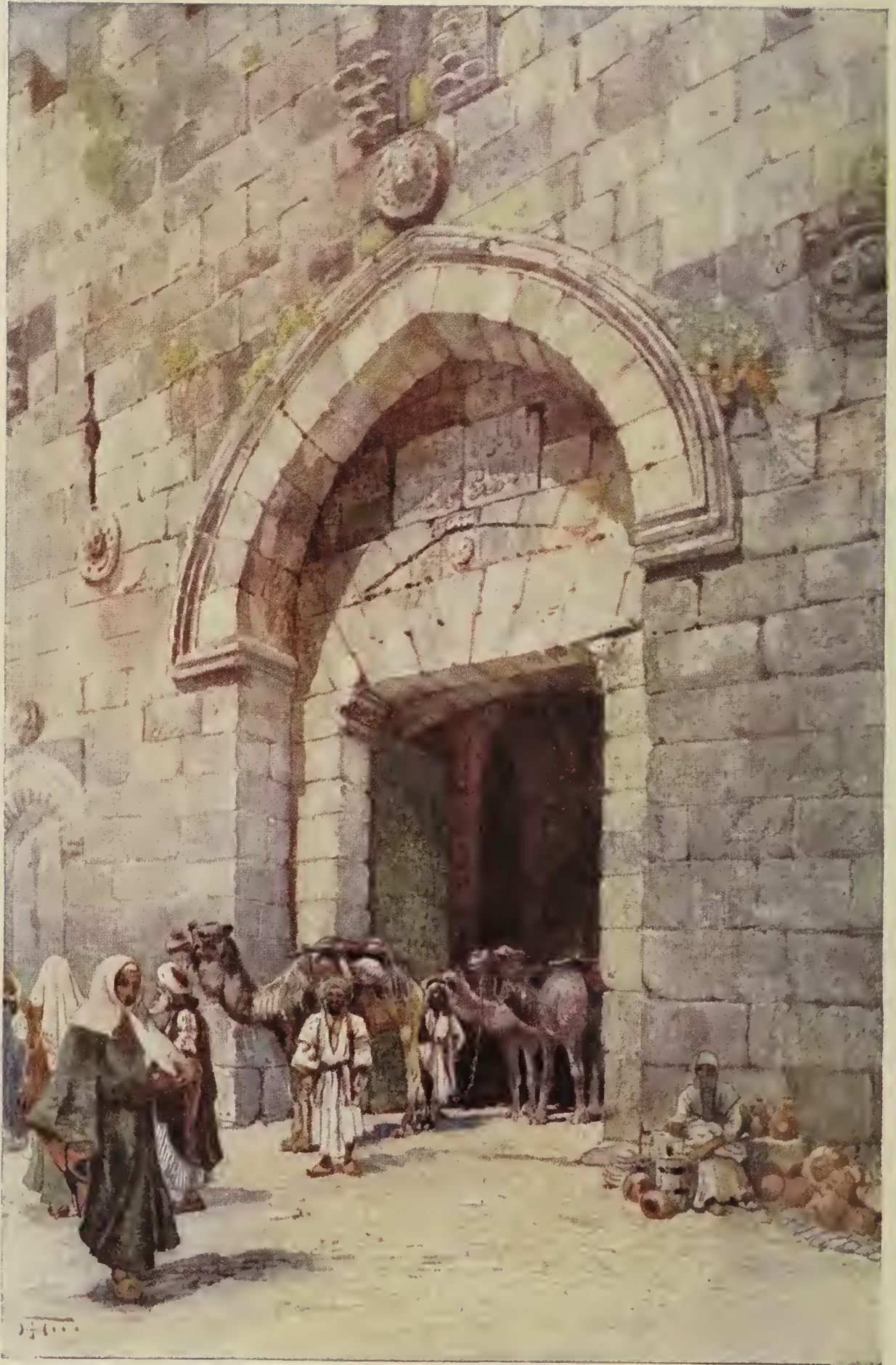
The Gate of David, Jerusalem.